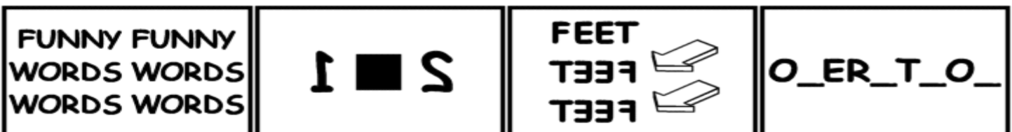
Try these Rebus Puzzles courtesy of fun-with-words.com. Answers: 1. Too funny for words 2. Back to square one 3. Two left feet 4. Painless operation