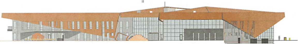
West Elevation 1/16" = 1'-0"