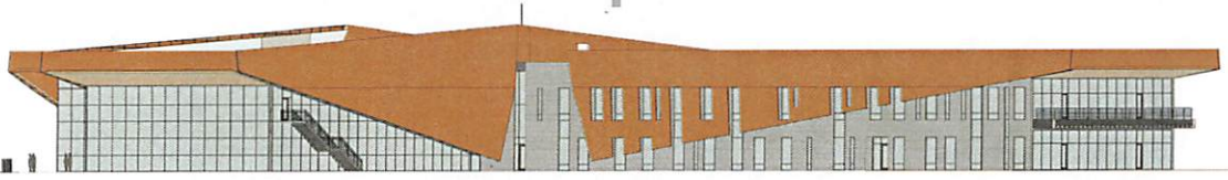
East Elevation 1/16" = 1'-0"